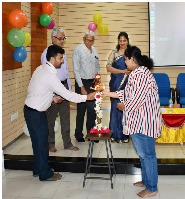
Dignitaries lighting the lamp