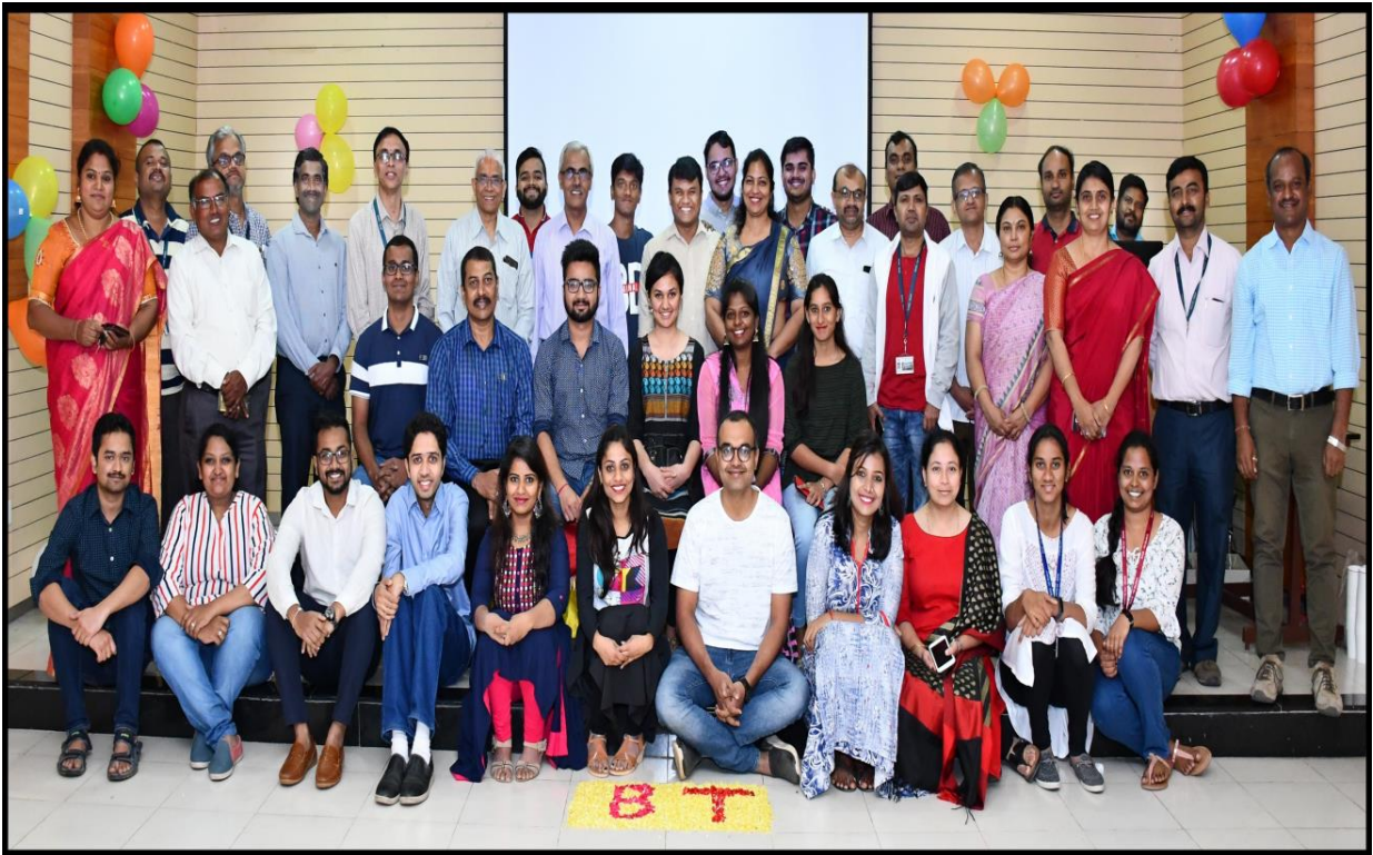
At the end of the formal function staged inside the IEM-Seminar hall, the celebration moved everyone gathered for a group photo.