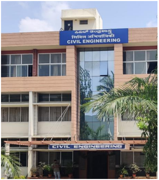
In association with