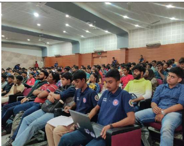
Students as Participants