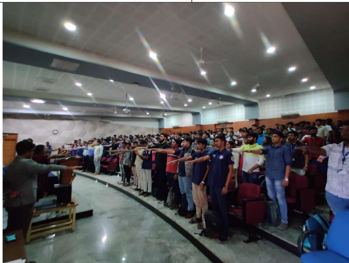
Taking oath by students to make campus Ragging free.