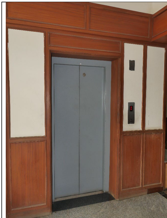
Lift in IEM Dept