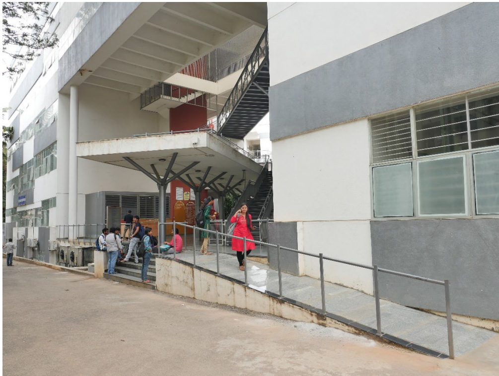
Ramp at the entrance of Electronics & Telecommunication Engg. Dept.