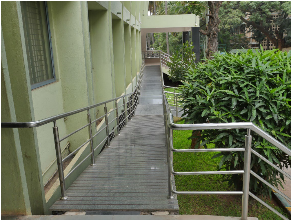
Ramp at the entrance of Auditorium

Each department has the Barrier Free facility namely Ramp, Lift to support Differently abled persons. Even the restrooms are designed to support them.