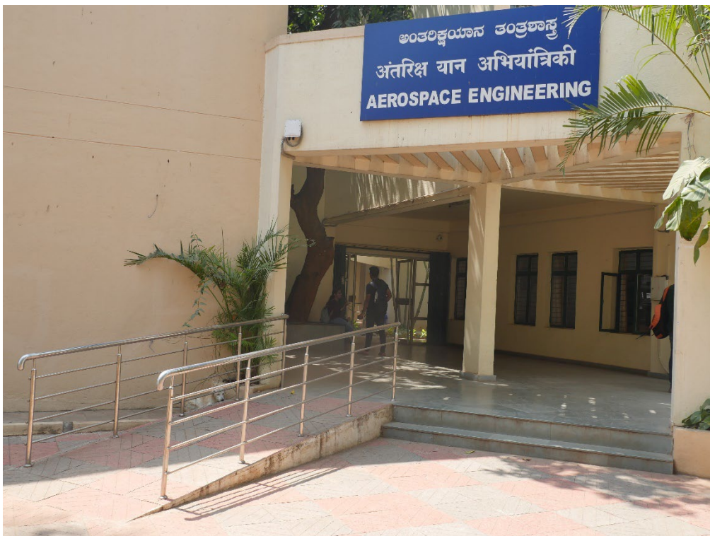
Ramp at the Entrance of Aerospace engg. Department