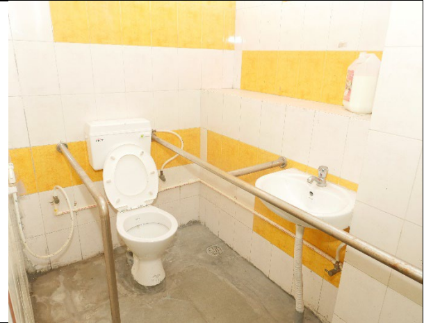
Special Designed Toilets for Physically Disabled