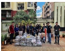
Figure 4 ROTARACT