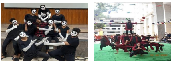
Figure 3 - CARV( CIRCLE OF ACTING AT RV)