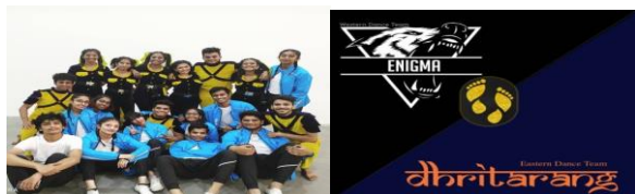
Figure 1 FOOTPRINTS (DANCE CLUB)

divisions: The Western association: Enigma, The Eastern association: Dhritarang, The Classical association.