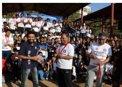
Figure 12 Utsarg Marathon - 2020