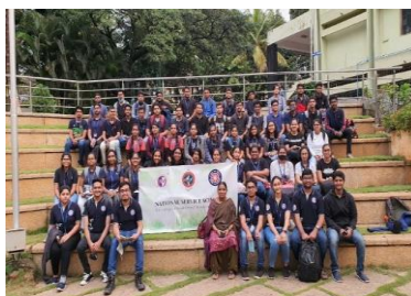
Figure 10 RVCE NSS Team 2021-22