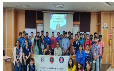
Figure 11 Azadi ka Amrut Mahotsav – Sakaala awareness - 2021