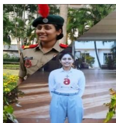
Figure 7 : NCC