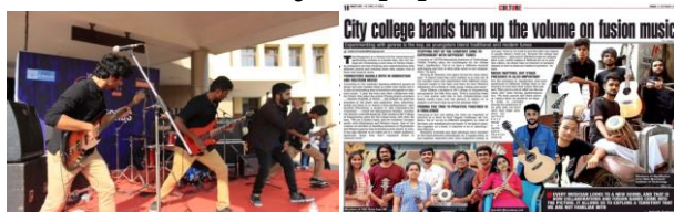
Figure 2 ALAAP (MUSIC CLUB)

Alaap is the music club of RVCE. With about 60 musicians who are well versed with different genres. play quite a few genres like Carnatic classical, Hindustani classical, western classical, jazz, pop, rock and some metal.