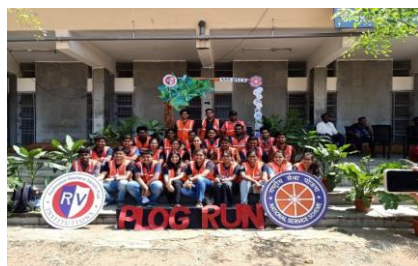
Figure 9 PLOG Run 2022