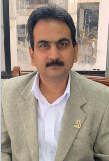
Vice-Chancellor of PES University