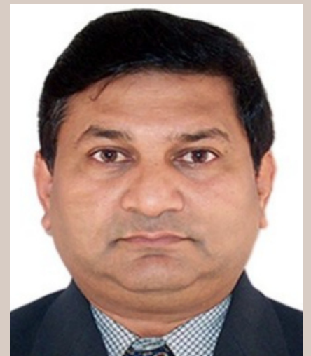
Cofounder of Deccan Group